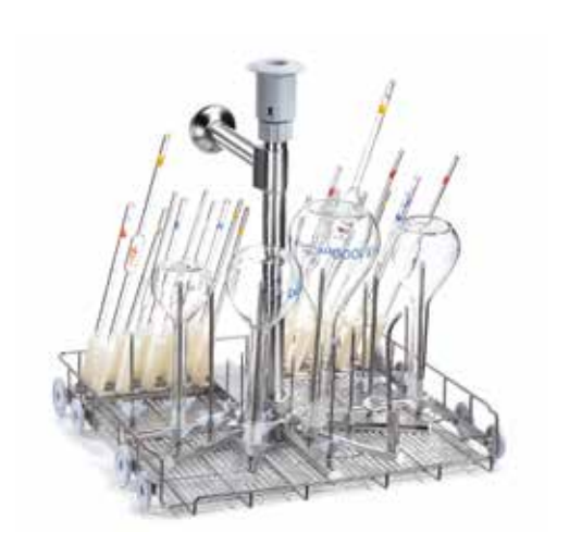
LPM2020DS Mixed injection carrier for washing and drying of flasks and pipettes