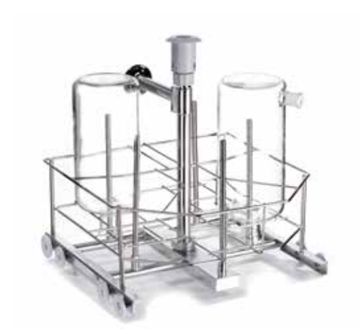
LBT5DS Trolley for bottles with drying system