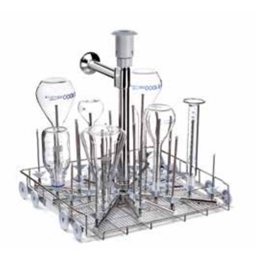
LM40DS Universal narrownecked glassware washing and drying carrier