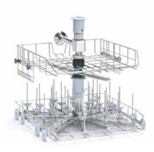
LM40ICS1DS Universal multifunctional trolleys with two washing levels