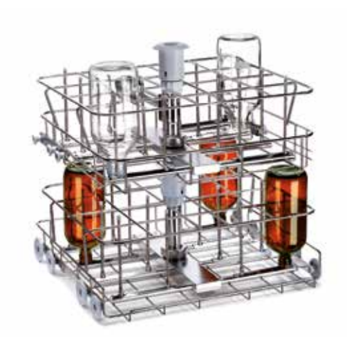
LB32DS Bottle washing and drying carrier

Can be switched from three-phase to three-phase without neutral or single-phase, to suit all types of electrical system present in the laboratory.