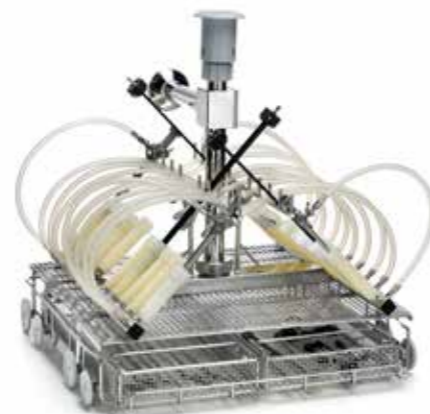
EF5DS Rigid videolaparoscope and endoscope trolley with drying connector