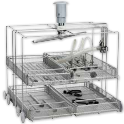
CSK4BMIC Two-level washing trolley suitable for disinfection of specific supports and/or baskets holding instruments