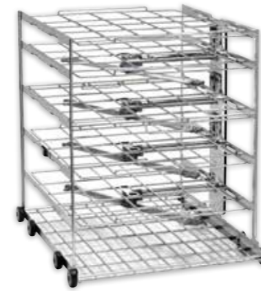
CSK1210FLEX 6 levels flexible multipurpose washing rack for simultaneous washing of standard and MIC surgical instruments