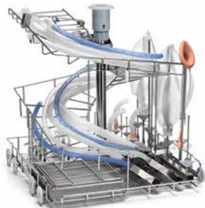
AE2BDS Anesthesia set washing trolley with drying system