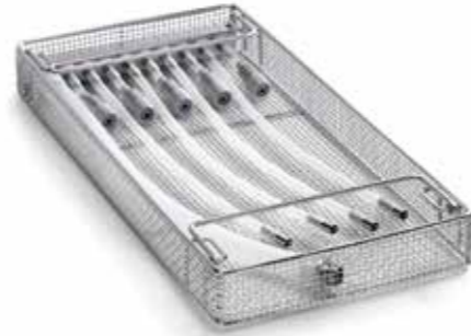
KITMIC10 Cannulate instruments basket