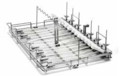
INSPMIC15 Stainless steel mini-invasive surgery trolley