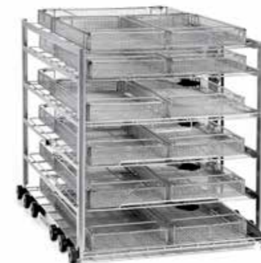
CSK1815FLEX 6 levels flexible multipurpose washing rack for simultaneous washing of standard and MIC surgical instruments