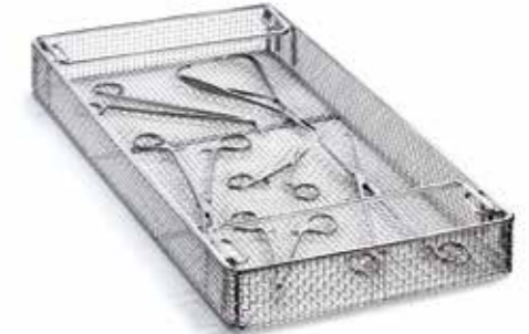
CSKDIN Instrument basket with handles. Suitable for holding medium-sized instruments