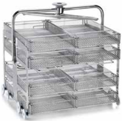
CSK8B Four-level washing trolley suitable for disinfection of specific support and/or baskets holding instruments