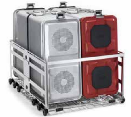
CPCDIN415 Stainless steel trolley for washing containers. 4 containers capacity injection rack.