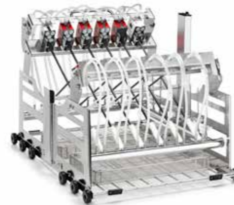
CSKDAVXISI15 Da Vinci surgery robot washing trolley - 12 positions - si and xi series. Suitable for automatic reprocessing and validated high level disinfection of Intuitive Surgical EndoWrist®