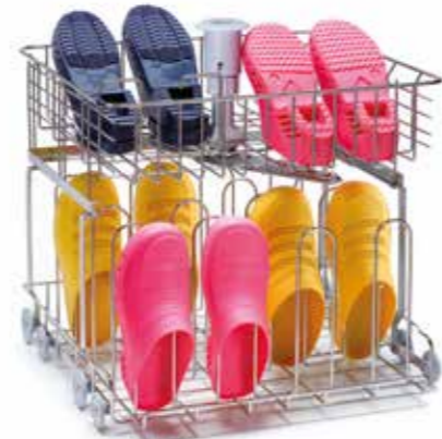
ZCS3B Two-level trolley for operating room shoe washing. Up to 14 pairs – maximum shoe size 45.